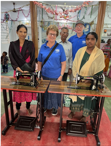
Two new machines for Vuyyuru Village tailoring school.

On our recent trip to Feed My People Ministry in India, we were given the privilege of helping distribute eight new sewing machines provided by Global Outreach. The new machines enabled tailoring schools to begin in three villages. The schools are for single mothers who are currently in dire financial straits.