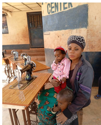
One of the single mothers who is in the tailoring program in Congo.