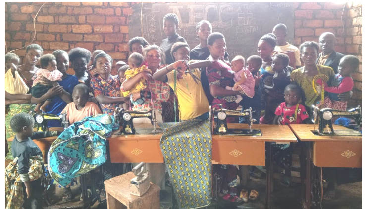
Fourteen single mothers began tailoring school in April 2024 in Fizi, DR Congo.