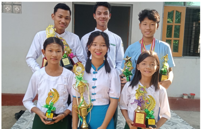
Several of the children at House of Refuge in Myanmar received awards at school.