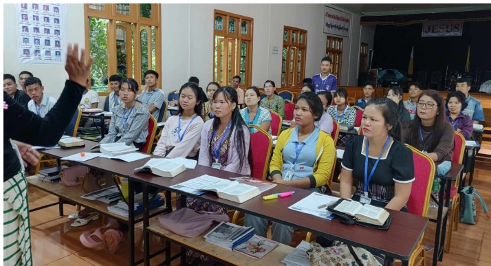
Eight hours of teaching, six days a week.

Many of the thirty-two students have returned for the second or third training school. Also, many of them have previously had Bible School or even Semi-