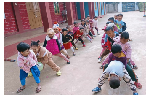
Fun and games for children at Agape Children’s Home in Myanmar.

assume responsibilities way beyond their age should require. This month we want to share some pictures of these children as they live and thrive in Christ-centered homes you support each month. Instead of worrying where their next meal will come from, they are free to attend school, experience love and compassionate care, and learn about Jesus’ love for them.