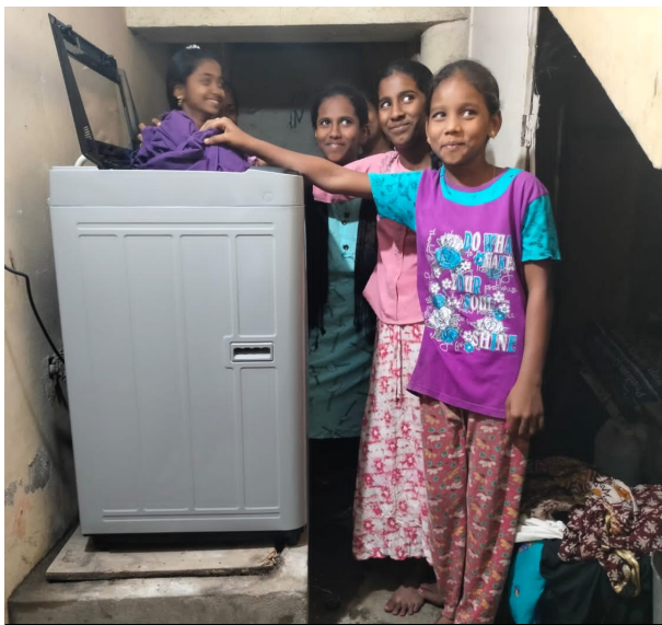
Girls in India were thrilled to get a washing machine!

assume responsibilities way beyond their age should require. This month we want to share some pictures of these children as they live and thrive in Christ-centered homes you support each month. Instead of worrying where their next meal will come from, they are free to attend school, experience love and compassionate care, and learn about Jesus’ love for them.