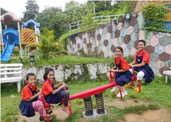
An outing to a park brings joy to children at Grace Children’s Home in Bangladesh.

The children being raised in the twenty-five homes supported by Global Outreach come from very difficult and challenging situations. They often come with much sadness, illness, malnutrition, lack of care and education. They may have had to