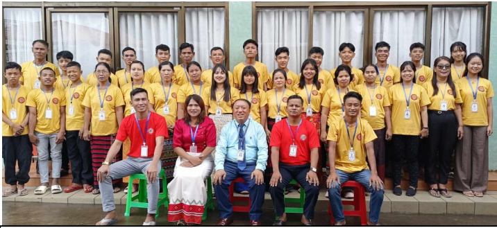
Students and staff of the 5th Mission Training School